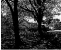
HO213 - Plenty State School 4093- former School from south, at rear behind oaks