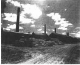
Darley Refractories Pty. Ltd.