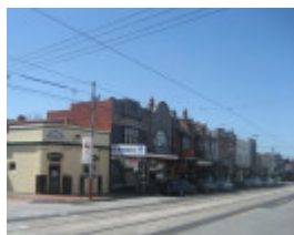
Shops on the north side of Malvern Road between Cressy Street and Tooronga Road