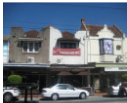
1376-78 and 1374 Malvern Road