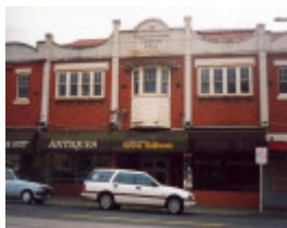
Tooronga Hall, 1990.