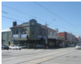
Malvern Road looking east from Tooronga Road