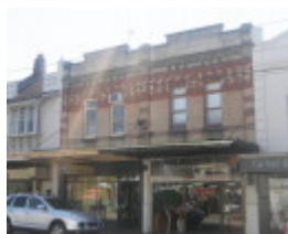
1415-1419 Malvern Road