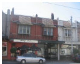
1415-1419 Malvern Road