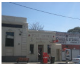
Tooronga Post Office