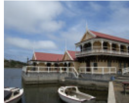
PROUDFOOT'S BOATHOUSE SOHE 2008