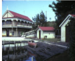
1 proudfoot's boathouse simpson street warrnambool view of property mar1985