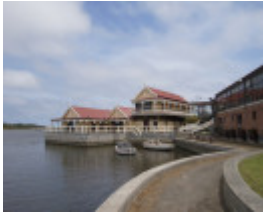
PROUDFOOT'S BOATHOUSE SOHE 2008