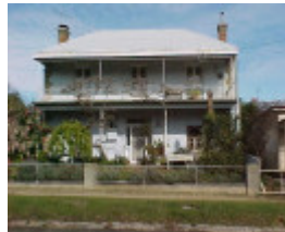
1 bellevue 9 williams street beechworth