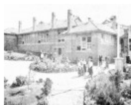
Bendigo Senior Secondary College_1914 building