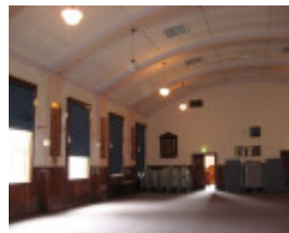
Bendigo Senior Secondary College_hall_KJ_Nov 09