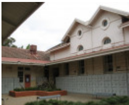
Bendigo Senior Secondary College_courtyard of 1914 building with remnants of 1870 building_KJ_Nov 09