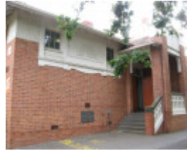
Bendigo Senior Secondary College_entrance to 1914 building_KJ_Nov 09