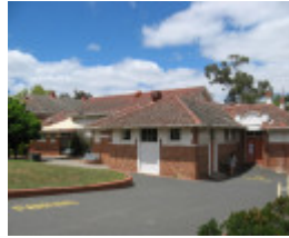
Bendigo Senior Secondary College_rear of 1914 building_KJ_Nov 09