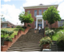
Bendigo Senior Secondary College_steps and 1930 building_KJ_Nov 09