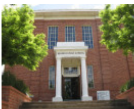
Bendigo HS_1930 building entrance_KJ_Nov 09 (19).jpg