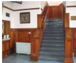
Bendigo Senior Secondary College_foyer of 1930 building_KJ_Nov 09