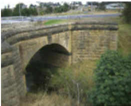
1 bridge over waurn ponds creek side view apr1997