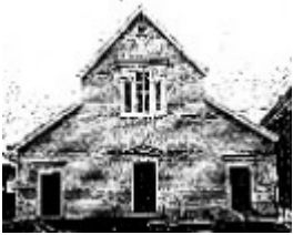
Methodist Hall Complex - Ballarat Heritage Review, 1998