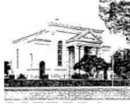
Synagogue - Film 2 / Frame 31- Ballarat Conservation Study, 1978