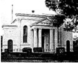
Synagogue Barkly St Princes St - Ballarat Heritage Review, 1998