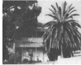
Sea View House. 27 Hesse Street