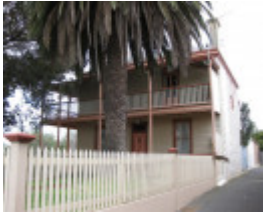
Sea View House. 27 Hesse Street, Queenscliff