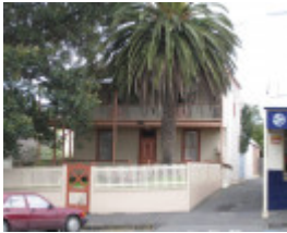
Sea View House. 27 Hesse Street, Queenscliff