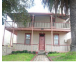
Sea View House. 27 Hesse Street, Queenscliff