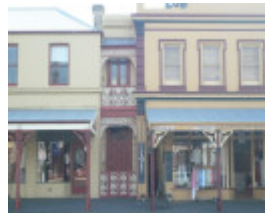
58 Hesse Street, Queenscliff