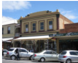
58 Hesse Street, Queenscliff