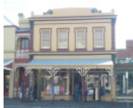
58 Hesse Street, Queenscliff