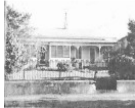
58 Hesse Street, Queenscliff