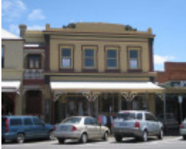
58 Hesse Street, Queenscliff