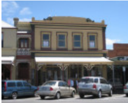
58 Hesse Street, Queenscliff