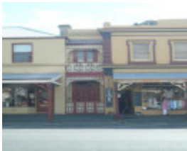
58 Hesse Street, Queenscliff