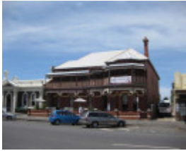
Queenscliff Inn, 59 Hesse Street, Queenscliff