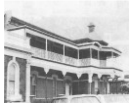
Olinda House, 59 Hesse Street, Queenscliff