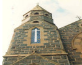
1 crossroads uniting church werribee tower detail