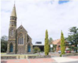
CROSSROADS UNITING CHURCH SOHE 2008