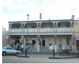
Doongara, 62 Hesse Street (37 Learmonth Street), Queenscliff