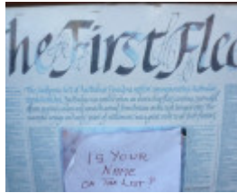
Doongara, 62 Hesse Street (37 Learmonth Street), Queenscliff