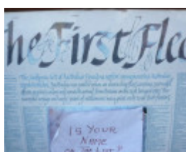
Doongara, 62 Hesse Street (37 Learmonth Street), Queenscliff