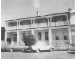
Doongara, 62 Hesse Street