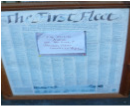
Doongara, 62 Hesse Street (37 Learmonth Street), Queenscliff