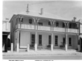
SLV c1950 Doongara, 62 Hesse Street (37 Learmonth Street), Queenscliff