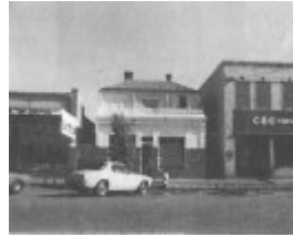
80 Hesse Street, Queenscliff