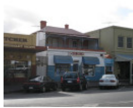
80 Hesse Street, Queenscliff