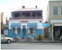
80 Hesse Street, Queenscliff