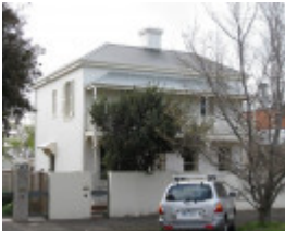
Coombe Lodge, 90 Hesse Street, Queenscliff,