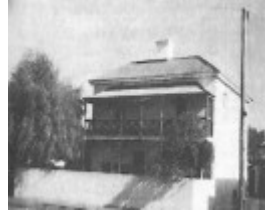
Coombe Lodge, 90 Hesse Street, Queenscliff,