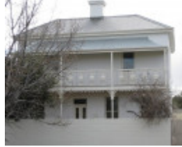
Coombe Lodge, 90 Hesse Street, Queenscliff,