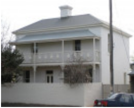
Coombe Lodge, 90 Hesse Street, Queenscliff,