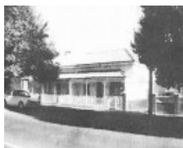
Warley and Shenfield Cottages.