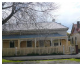
Warley Cottage, 94 Hesse Street and Shenfield, 96 Hesse Street, Queenscliff