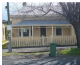
Warley Cottage, 94 Hesse Street and Shenfield, 96 Hesse Street, Queenscliff