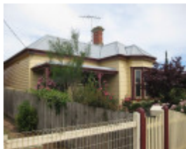
Romford, 105 Hesse Street, Queenscliff