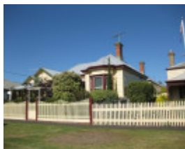
Romford, 105 Hesse Street, Queenscliff