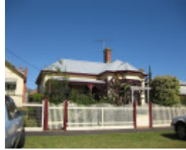
Romford, 105 Hesse Street, Queenscliff