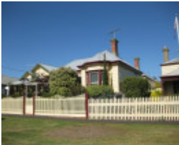
Romford, 105 Hesse Street, Queenscliff