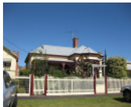
Romford, 105 Hesse Street, Queenscliff