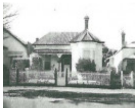
Romford, 105 Hesse Street, Queenscliff