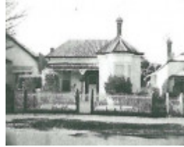
Romford, 105 Hesse Street, Queenscliff