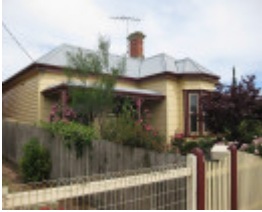
Romford, 105 Hesse Street, Queenscliff