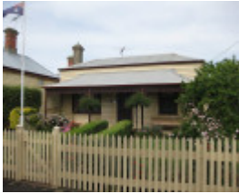
Navestock, 107 Hesse Street, Queenscliff