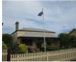
Navestock, 107 Hesse Street, Queenscliff