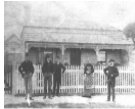
Navestock, undated