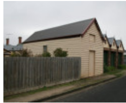
Rear of 107 Hesse Street Poss Ind HO