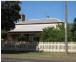
Navestock, 107 Hesse Street, Queenscliff