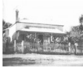
Navestock, 107 Hesse Street, Queenscliff