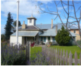
Bronte, 11-13 Learmonth Street, Queenscliff