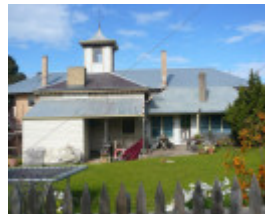
Bronte, 11-13 Learmonth Street, Queenscliff