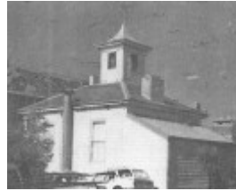
Bronte, 11-13 Learmonth Street, Queenscliff