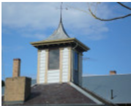
Bronte, 11-13 Learmonth Street, Queenscliff