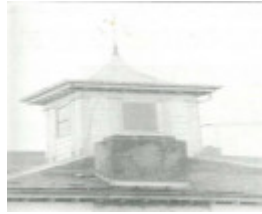
Bronte, 11-13 Learmonth Street, Queenscliff