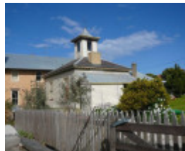
Bronte, 11-13 Learmonth Street, Queenscliff