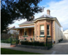
Wyndom, 59 Learmonth Street, Queenscliff