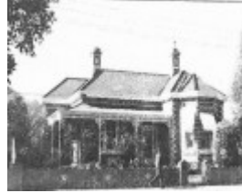
59 Learmonth Street, Queenscliff