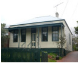
Former Barkly Inn, 72 Learmonth Street, Queenscliff