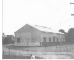
The Youth Club