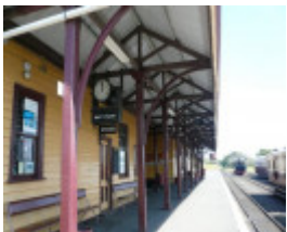
Platform of the Queenscliff Railway Station