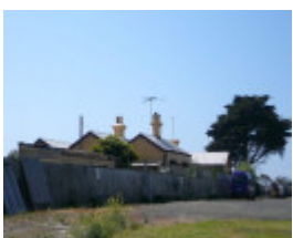
View towards the station from the south-west