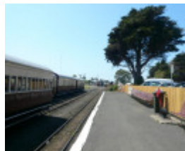
View along platform of the Queenscliff Railway Station looking east.