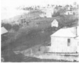
Railway Station Precinct looking North-East c.1905