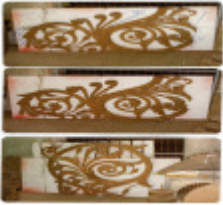
Mining Exchange_Iron works_1