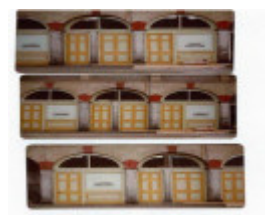
Mining Exchange_3