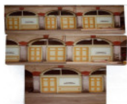
Mining Exchange_4