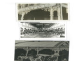
Mining Exchange_1_c1901