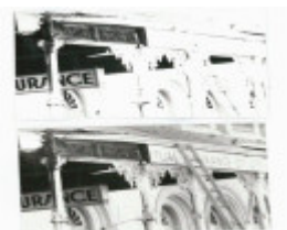
Mining Exchange_Streetscape_6