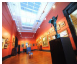
BALLARAT ART GALLERY_Colonial Gallery_1.jpg 2010