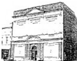
Fine Art Gallery - Ballarat Conservation Study, 1978