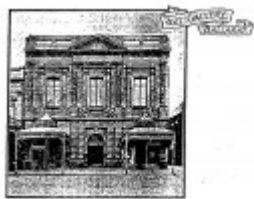
Fine Art Gallery02 - Ballarat Illustrated - Ballarat Conservation Study, 1978