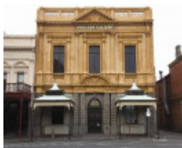
BALLARAT ART GALLERY_Restored Facade_Compressed.jpg 2010