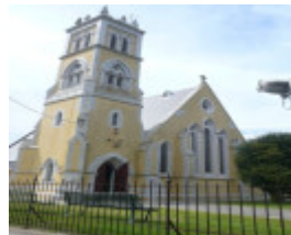
St. Georges Church