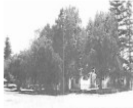
Corner Hobson and Learmonth Streets looking towards St. George's