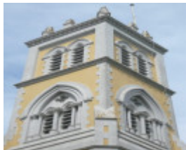
St. Georges Church