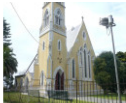
St. Georges Church