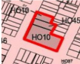
St. Georges Church Precinct