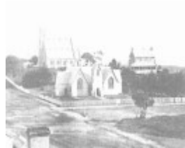
Church of England Parsonage and School c.1882