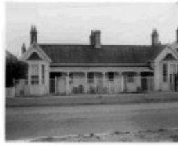
Pilots Row, 60-62, Gellibrand Street c1983-1986