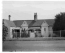
Pilots Row, 66-68 Gellibrand Street c. 1983-1986