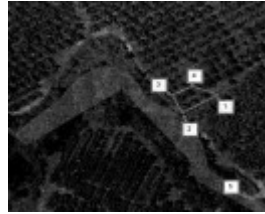
HO197 5 Pear Trees