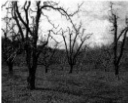
HO197 5 Pear Trees