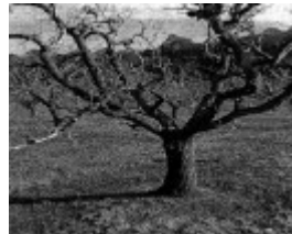
HO197 5 Pear Trees