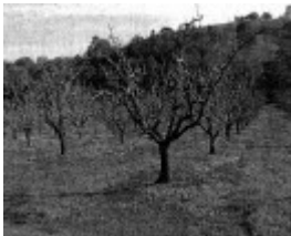
HO197 5 Pear Trees