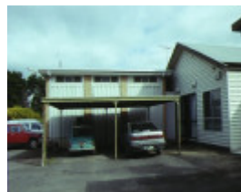
kardinia house riverview terrace belmont additions