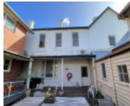
back of Kardinia house from courtyard with both extensions visible. 2023.