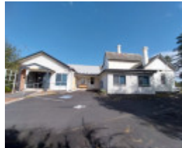
Eastern elevation of Kardinia House. 2023.