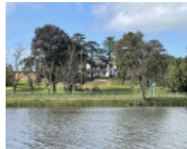
Views of the house and landscape across the river. 2023.