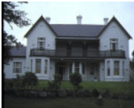
1 kardinia house riverview terrace belmont front view green balcony