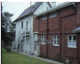
kardinia house riverview terrace belmont side view of house