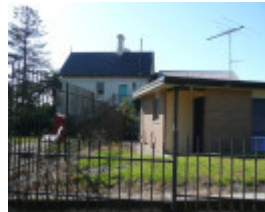
KARDINIA HOUSE SOHE 2008