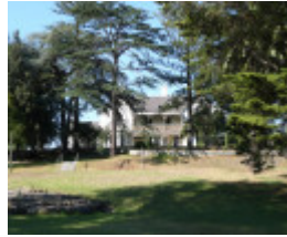
KARDINIA HOUSE SOHE 2008