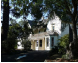
KARDINIA HOUSE SOHE 2008