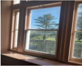
Views to the river from the house. 2023.