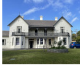
Kardinia House primary facade. 2023.