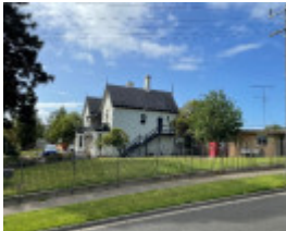
Kardinia House with bay windows and cast-iron verandahs. 2023.