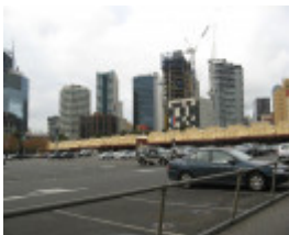
Queen Vic Market 5.jpg