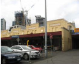
Queen Vic Market 8.jpg