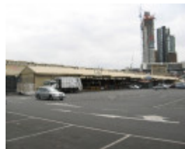
Queen Vic Market 6.jpg