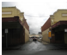
Queen Vic Market 22.jpg