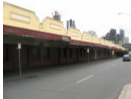
Queen Vic Market 18.jpg