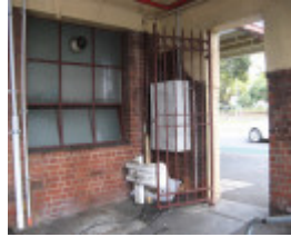
Queen Vic Market 13.jpg