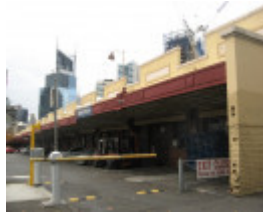
Queen Vic Market 9.jpg