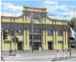
Queen Victoria Market SOHE 2008