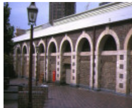
queen victoria market victoria street melbourne side view meat & fish market