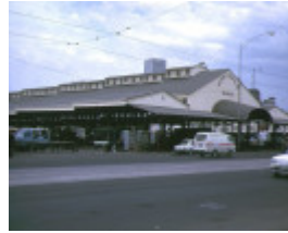
1 queen victoria market victoria street melbourne front view market sheds