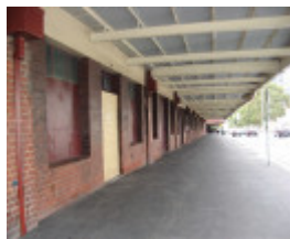
Queen Vic Market 15.jpg