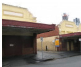
Queen Vic Market 21.jpg