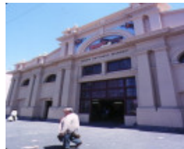
queen victoria market victoria street melbourne front view of meat market & food hall