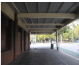
Queen Vic Market 14.jpg