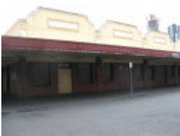
Queen Vic Market 17.jpg