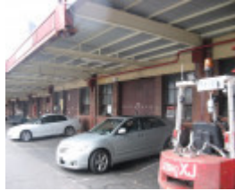
Queen Vic Market 12.jpg