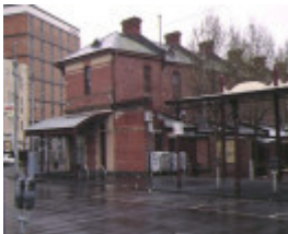
queen victoria market victoria street melbourne peel & victoria street corner