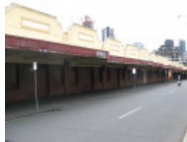
Queen Vic Market 19.jpg