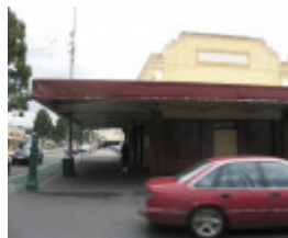
Queen Vic Market 16.jpg