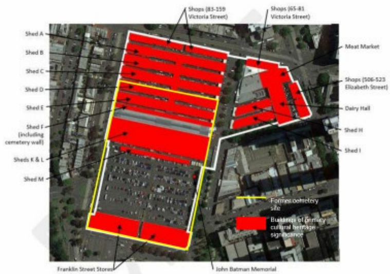
Permit exemption diagram 2023