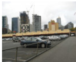
Queen Vic Market 4.jpg