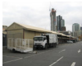
Queen Vic Market 3.jpg