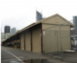
Queen Vic Market 2.jpg