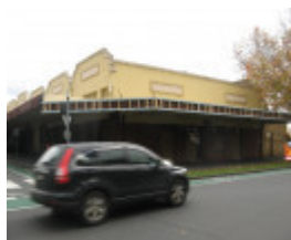
Queen Vic Market 24.jpg