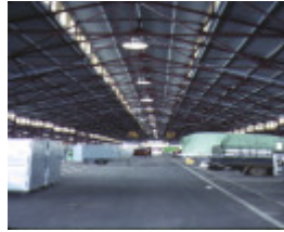
queen victoria market victoria street melbourne interior market shed roof detail