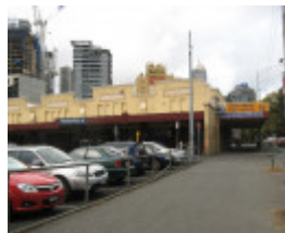
Queen Vic Market 7.jpg