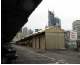
Queen Vic Market 1.jpg