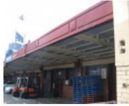
Queen Vic Market 10.jpg