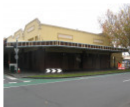
Queen Vic Market 25.jpg