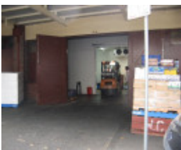
Queen Vic Market 23.jpg