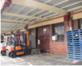
Queen Vic Market 11.jpg