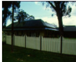
Keilor Hotel Side