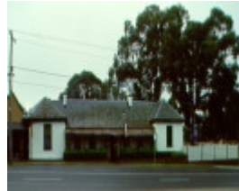
H01974 1 keilor hotel front