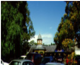
Keilor Hotel Rear