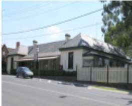
KEILOR HOTEL SOHE 2008