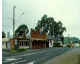
Keilor Hotel Facade