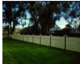
Keilor Hotel Side