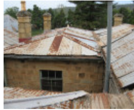
121693_former survey office_Helenslee_Heathcote_A (1).jpg