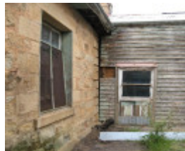
121693_former survey office_Helenslee_Heathcote_A (1).jpg