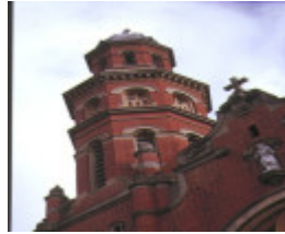
st josephs benalla detail of tower jun1989