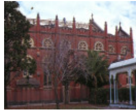
st josephs benalla north side jan1989