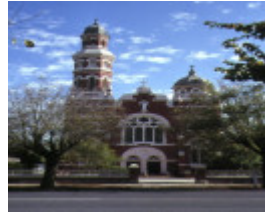
1 st josephs benalla front view