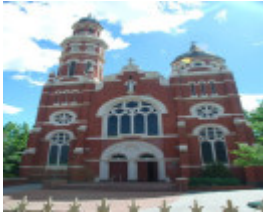
ST JOSEPHS CATHOLIC CHURCH SOHE 2008