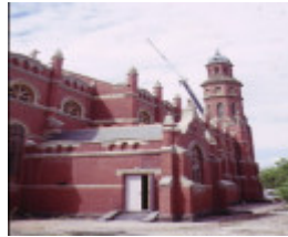
st josephs benalla rear entry dec1989