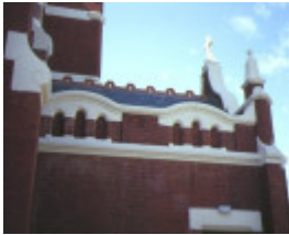
st josephs benalla exterior detail of wavy parapet