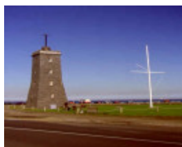
1 time ball tower point gellibrand williamstown june1999