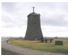
TIME BALL TOWER SOHE 2008