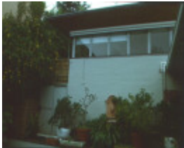
H01963 roy grounds house rear view aug01