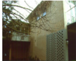
H01963 roy grounds house flats aug01