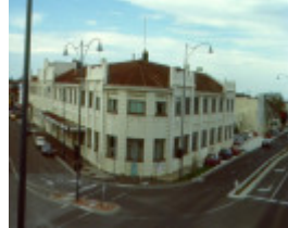
HV MCKAY OFFICES SOHE 2008 H01966 1 hv mckay offices