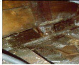
Prefabricated Cottage Post Detail June 2001