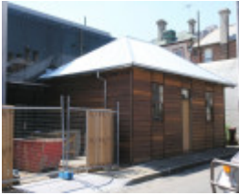
PREFABRICATED COTTAGE SOHE 2008