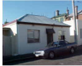
1 prefabricated cottage coventry street facade june01