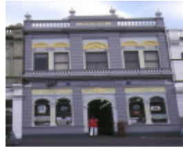
1 former advertiser building nelson place williamstown front elevation