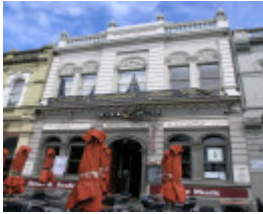
FORMER ADVERTISER BUILDING SOHE 2008