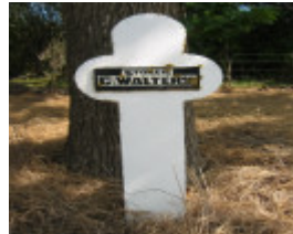
12270 Eurack avenue of honour9 nov05