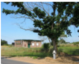
Eurack Avenue of Honour November 2005