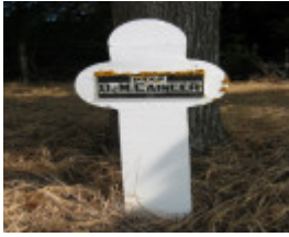
Eurack Avenue of Honour November 2005