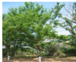
Eurack Avenue of Honour November 2005