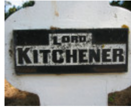
Eurack Avenue of Honour November 2005