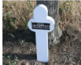
AVENUE OF HONOUR SOHE 2008