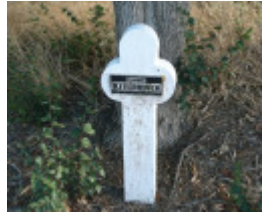
AVENUE OF HONOUR SOHE 2008