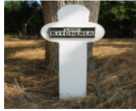
Eurack Avenue of Honour November 2005