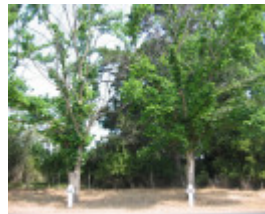
Eurack Avenue of Honour November 2005