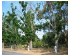
Eurack Avenue of Honour November 2005