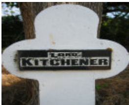
Eurack Avenue of Honour November 2005