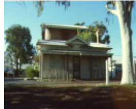
1state research farm managers office june01