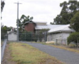
STATE RESEARCH FARM SOHE 2008