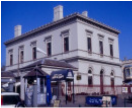
former customs house cnr nelson place and syme st williamstown cnr view she project 2003