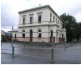
FORMER CUSTOMS HOUSE SOHE 2008