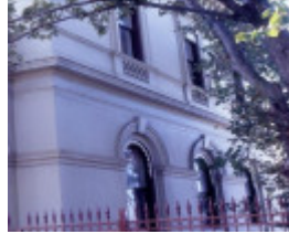
former customs house cnr nelson place and syme st williamstown close up windows she project 2003