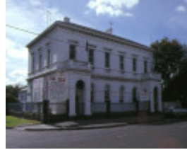
1 former customs house nelson place williamstown front view