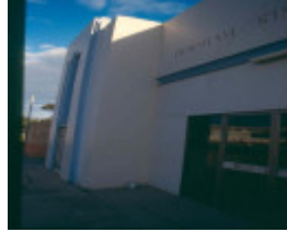
H01985 wimmera stock bazaar front detail dec01