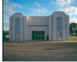
H01985 wimmera stock bazaar front dec01