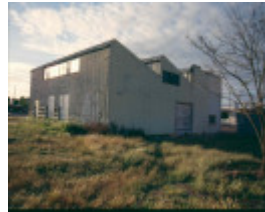
H01985 wimmera stock bazaar southeast dec01