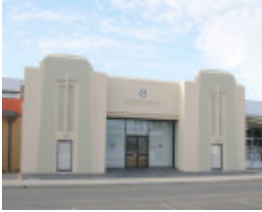
FORMER WIMMERA STOCK BAZAAR SOHE 2008