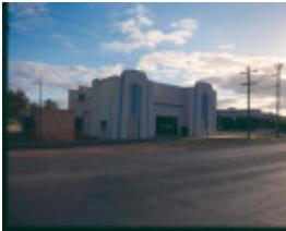
H01985 wimmera stock bazaar northeast dec01