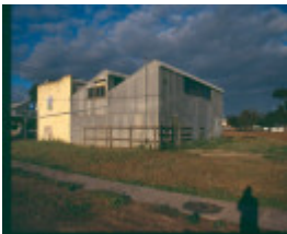
Wimmera Stock Bazaar Southwest December 2001