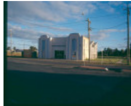
H01985 wimmera stock bazaar north dec01