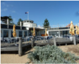
H0927 DRESSING PAVILION LHA 2015 1.JPG