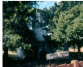
H01992 templer church hall front 2002