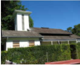
TEMPLER CHURCH HALL SOHE 2008