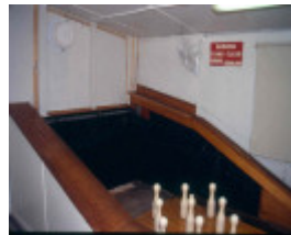
H01992 templer church hall skittle alley 2002