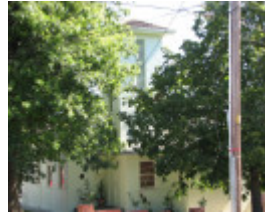
TEMPLER CHURCH HALL SOHE 2008