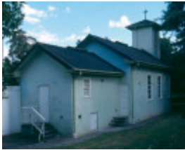
H01992 templer church hall from south east 2002