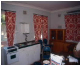
H01992 templer church hall schoolroom cum clubroom