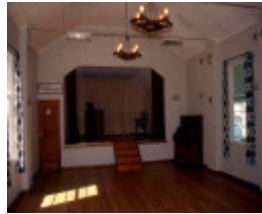
H01992 templer church hall interior 2002