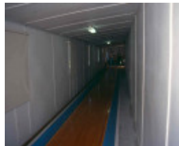
H01992 templer church hall skittle alley looking north 2002