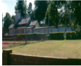
H01992 1 templer church hall from south west 2002