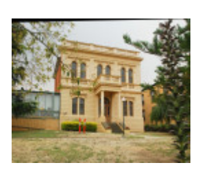
ANNE CAUDLE CENTRE SOHE 2008