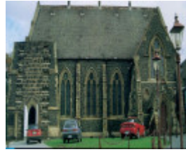
St Giles Church Gheringhap Street Geelong Front Elevation