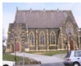
St Giles Church Geelong Church Front View