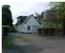
H00633 st giles church gheringhap street geelong rear of masters residence oct01