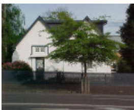
H00633 st giles geelong masters residence oct01