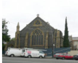
FORMER ST GILES CHURCH AND FREE CHURCH SCHOOL SOHE 2008