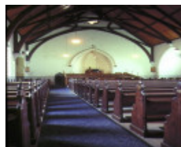
H00633 st giles church gheringhap street geelong interior view of church oct01