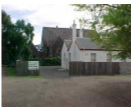
H00633 st giles church gheringhap street geelong rear of school oct01