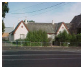
H00633 st giles geelong free church school oct01