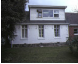
St Giles Church Gheringhap Street Geelong Former School Masters Residence Jul 1985