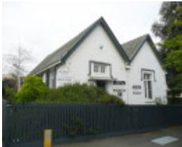
FORMER ST GILES CHURCH AND FREE CHURCH SCHOOL SOHE 2008