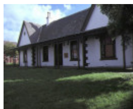
St Giles Church Gheringhap Street Geelong Former Free Church School May 1985