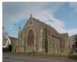
H00633 st giles church geelong church front view oct01