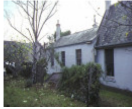
St Giles Church Gheringhap Street Geelong Manse Former Free Church School Side View Jul 1985