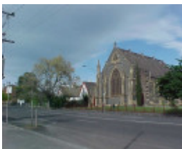
H00633 1 former st giles church and free church school geelong oct01