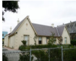
FORMER ST GILES CHURCH AND FREE CHURCH SCHOOL SOHE 2008