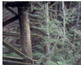
h01995 timber bridge bloomfield road crossover underneath she project 2003