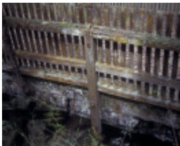
h01995 timber bridge bloomfield road crossover handrail she project 2003