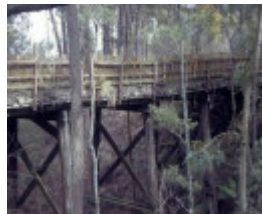
h01995 timber bridge bloomfield road crossover view of bridge she project 2003