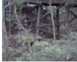
h01995 timber bridge bloomfield road crossover below she project 2003