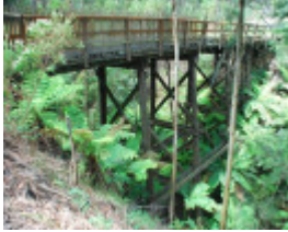
TIMBER BRIDGE SOHE 2008