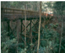
h01995 crossover bridge 2001