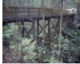
h01995 1 timber bridge bloomfield road crossover bridge she project 2003