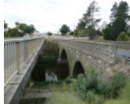
BRIDGE SOHE 2008