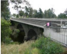
BRIDGE SOHE 2008