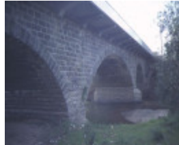
1 bridge over barwon river winchelsea arch detail jun1984