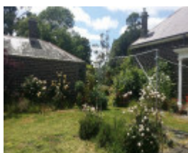
Homestead precinct north east.jpg