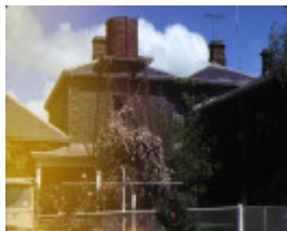
1 ingleby homestead & outbuildings ingleby rd winchelsea rear view