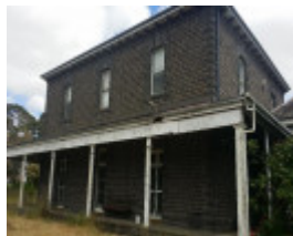
Ingleby South east elevation 2016.jpg