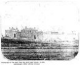
Photograph of the gaol from the north west corner, c.1861 - Film 1 / Frames 5,6,8 - Ballarat Conservation Study, 1978