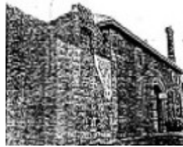
Old Gaol - Film 1 / Frames 5,6,8 - Ballarat Conservation Study, 1978