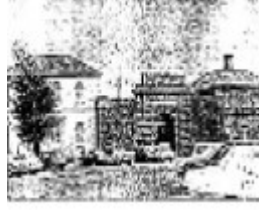
Old Gaol - Film 1 / Frames 5,6,8 - Ballarat Conservation Study, 1978